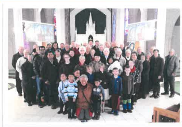
The Parish Pilgrimage to the Cathedral of the Holy Spirit Saturday 13 August 2016