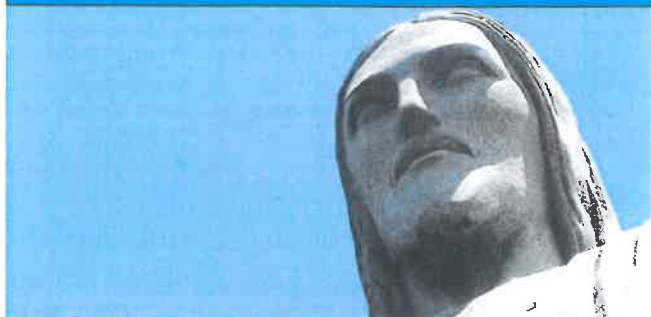
Falling Rocks at Times, but Still Rocks

Some rock, that Peter. A couple of weeks ago, we read how he almost drowned in a storm because he lacked faith. In Holy Week we read about how he denied knowing Jesus – his close friend – to three people to save his skin. And this week Jesus tells us that this guy will be the rock upon which he builds his Church.